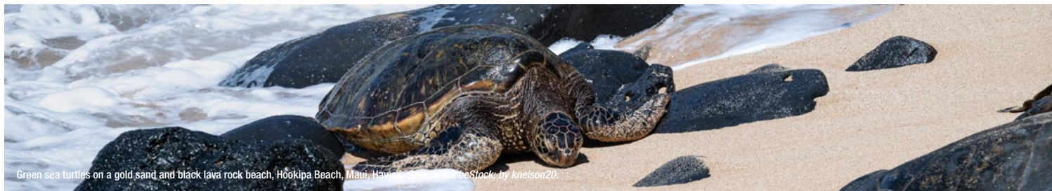
Green sea turtles on a gold sand and black lava rock beach, Hoopika Beach, Maui, Hawaii.

The undersigned APPLICANT, agreeing to be legally bound hereby, applies for benefactor level opportunity in the 10th International Conference on Microtechnologies in Medicine and Biology (MMB) and is subject to the terms, conditions, policies and procedures stated herein and outlined on the MMB website at www.mmb2026.org . The MMB Conference, upon its written acceptance of this Application is to assign benefactor level to the Applicant under all of the terms, conditions, and requirements as aforesaid. Benefactor levels will be assigned on a first-come first-served basis.